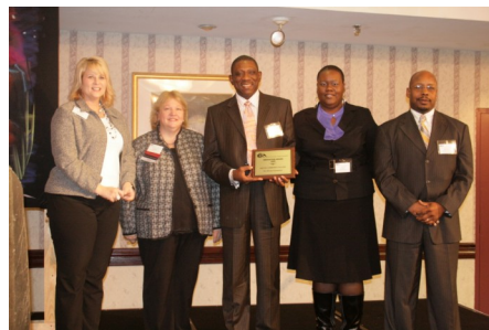
Oakton Community College