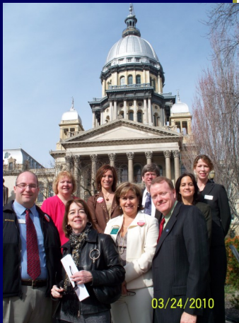
Lobby Day March 24, 2010

"The greatest thing in this world is not so much where we stand, as in what direction we are moving."- Oliver Wendall Holmes