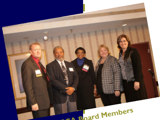
ICCCA Board Members