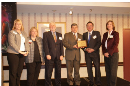
Kankakee Community College