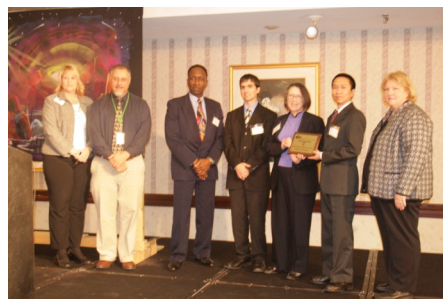
Wilbur Wright College