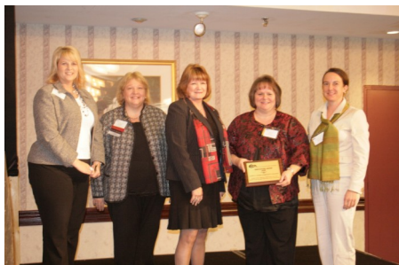
John A. Logan College