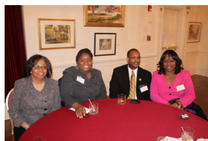
Attendees enjoying the Governor's Mansion Reception