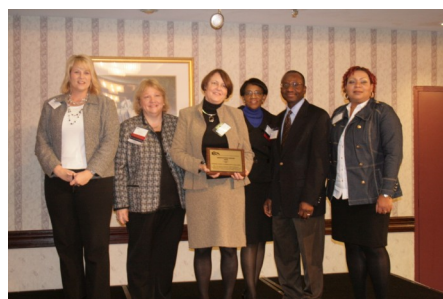
Prairie State College