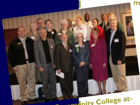
Richland Community College attends ICCCA Conference