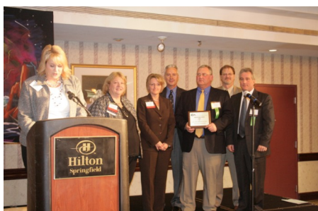
Lake Land Community College