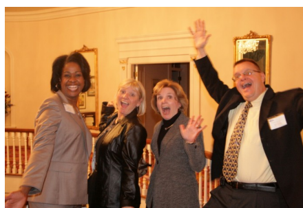
ICCCA attendees having some fun at the Governor's Mansion