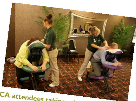
ICCCA attendees taking a break and getting a massage