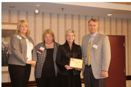
Lewis and Clark Community College