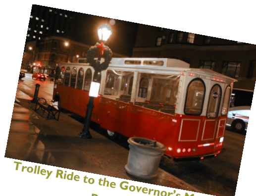
Trolley Ride to the Governor's Mansion Reception