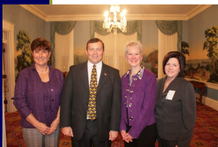
Rend Lake College at the Governor's Mansion