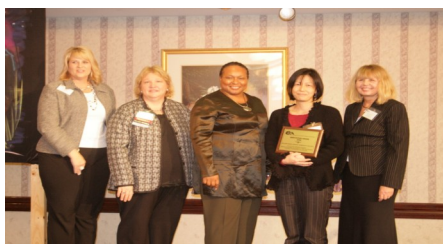
William Rainey Harper College